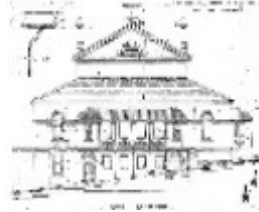
Old Supreme Court - Ballarat Conservation Study, 1978