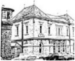
Old Supreme Court - Film 1 / Frames 7,9 - Ballarat Conservation Study, 1978