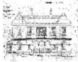
Old Supreme Court - Ballarat Conservation Study, 1978