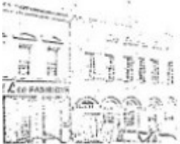
The Ballarat Courier - Film 2 / Frame 5 - Ballarat Conservation Study, 1978