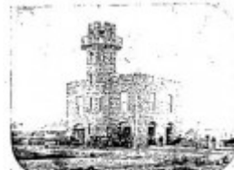
ballarat City Fire Station - c.1861 SLV - Ballarat Conservation Study, 1978