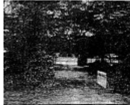
Cemetery Precinct - view of cemetery looking east - 1983 Buninyong Conservation Study