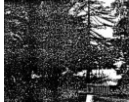
Cemetery Precinct - view of cemetery looking north to cemetery gates - 1983 Buninyong Conservation Study