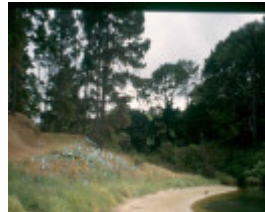
H01996 shoreham pines4