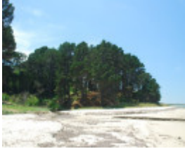
THE PINES (FORESHORE RESERVE) SOHE 2008