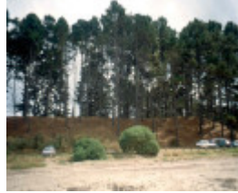
H01996 shoreham pines2