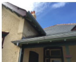
After Photographs - Reference F3843 2016