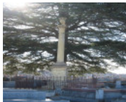
h00798 bendigo cemetery burke wills memorial 08 03 mz