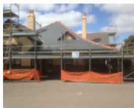
During Photographs - Reference F3843 2015