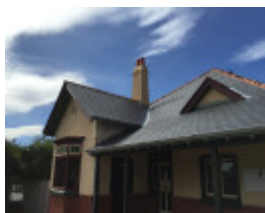
After Photographs - Reference F3843 2016