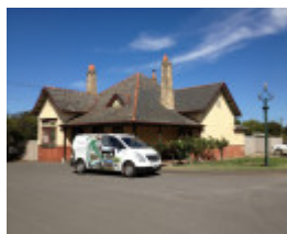
Before Photographs - Reference F3843 2014