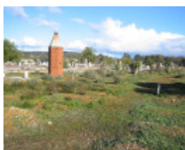
h00798 bendigo cemetery chinese section 03 08 03 mz