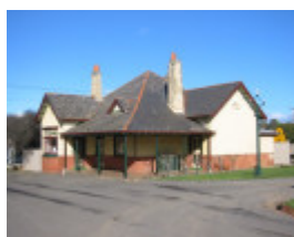
h00798 bendigo cemetery sextons lodge 08 03 mz