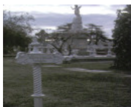
h00798 bendigo cemetery view of headstones