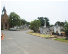
BENDIGO CEMETERY SOHE 2008