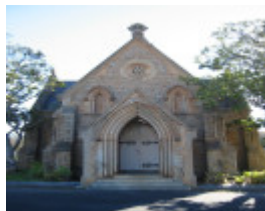
Bendigo Cemetery Chapel August 2003