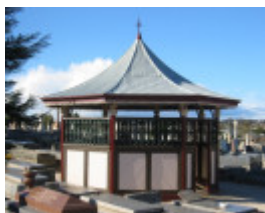
h00798 bendigo cemetery gazebo 08 03 mz