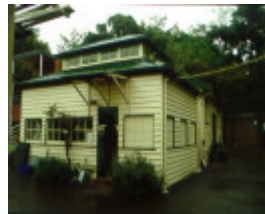
H01459 h1459 rbg paint shop in nursery oct 2001