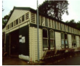
H01459 H1459 rbg mechanics workshop oct 2001