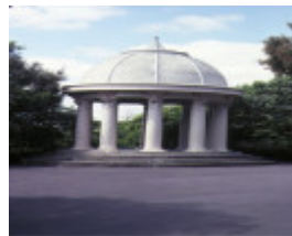
H01459 royal botanic gardens birdwood avenue south yarra temple of the winds sep1981