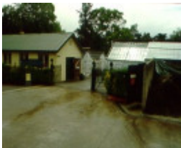
H01459 h1459 rbg nursery view oct 2001