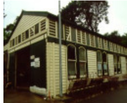
H01459 H1459 rbg mechanics workshop oct 2001