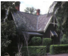
H01459 royal botanic Under gardener's cottage sep1981