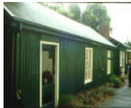
H01459 h1459 rbg prefab iron house in nursery oct 2001