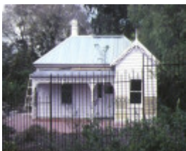
Royal Botanic Gardens Birdwood Avenue South Yarra Directors Cottage September 1981