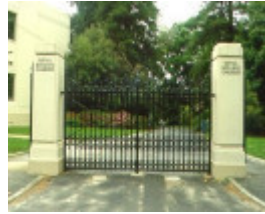
H01459 h1459 rbg d gate oct 2001