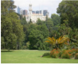
ROYAL BOTANIC GARDENS SOHE 2008