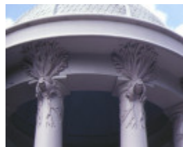
Royal Botanic Gardens Birdwood Avenue South Yarra Temple of the Winds Capital Detail September 1981