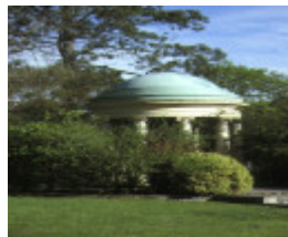
Royal Botanic Gardens Birdwood Avenue South Yarra Gazebo