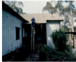
H02004 macgeorge house ivanhoe porch 02