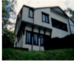
H02004 macgeorge house ivanhoe south side 02