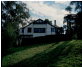
H02004 macgeorge house ivanhoe south side from river 02