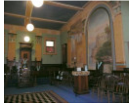
FREEMASONS HALL, ZETLAND LODGE SOHE 2008