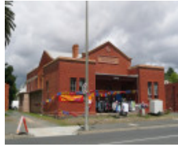
FREEMASONS HALL, ZETLAND LODGE SOHE 2008