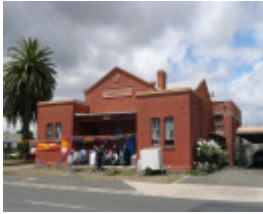
FREEMASONS HALL, ZETLAND LODGE SOHE 2008