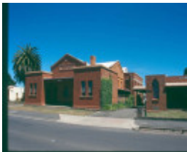
H01988 kyneton masonic hall jan2002 front