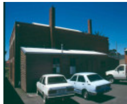
H01988 kyneton masonic hall jan2002 rear