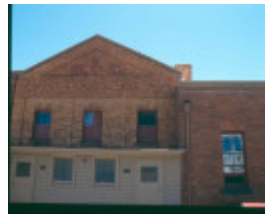
H01988 kyneton masonic hall jan2002 east