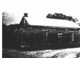
Later Hobbler Cottage