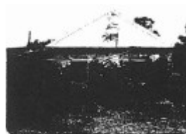
second part Hobbler Cottage