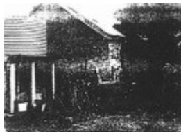
original Hobbler Cottage