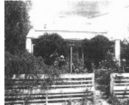
House, 8 Main Street. Mymiong