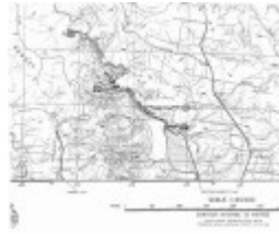
Broken Back Mine (disused) and Black Snake Mine