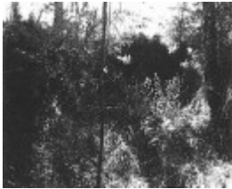
Broken Back Mine (disused) and Black Snake Mine