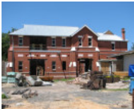
COMMUNITY OF THE HOLY NAME AND RETREAT HOUSE SOHE 2008