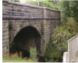
1 bridge over commissioners creek yackandandah side view