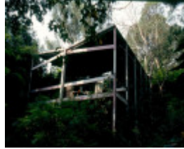
H02006 clemson house kew verandah 01