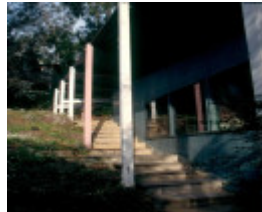
H02006 clemson house kew side view 01