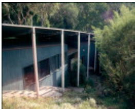
H02006 clemson house kew street side 01