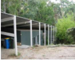
CLEMSON HOUSE SOHE 2008