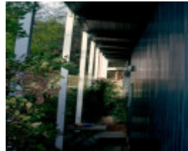
H02006 clemson house kew side columns 01