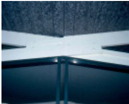
H02006 clemson house kew scissor junction 01