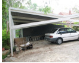
CLEMSON HOUSE SOHE 2008