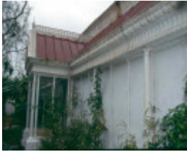
H02005 1 labassa conservatory june 2002