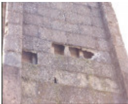
H02007 snake valley wesleyan tower detail 02