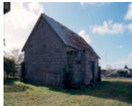
H02007 snake valley wesleyan rear vestibule 02