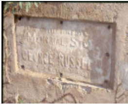
H02007 snake valley wesleyan memorial 02