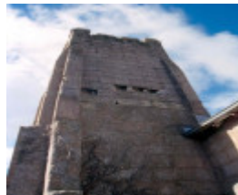
H02007 snake valley wesleyan tower rear 02