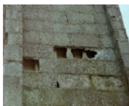
Snake Valley Wesleyan Tower Deterioration