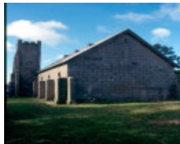
H02007 snake valley wesleyan rear 02