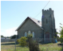
WELSH METHODIST CHURCH SOHE 2008