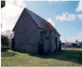
H02007 snake valley wesleyan rear vestibule 02