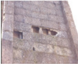
H02007 snake valley wesleyan tower detail 02