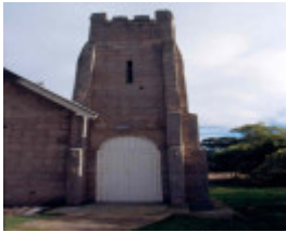
H02007 snake valley wesleyan tower front 02