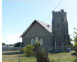
WELSH METHODIST CHURCH SOHE 2008