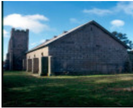
H02007 snake valley wesleyan rear 02