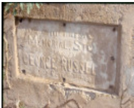
H02007 snake valley wesleyan memorial 02