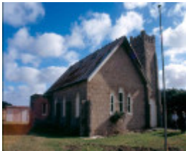
H02007 snake valley wesleyan front 02