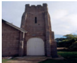
H02007 snake valley wesleyan tower front 02