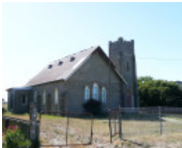
WELSH METHODIST CHURCH SOHE 2008