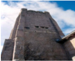
H02007 snake valley wesleyan tower rear 02