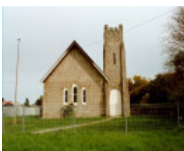
Snake Valley Wesleyan Front