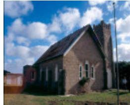
H02007 snake valley wesleyan front 02