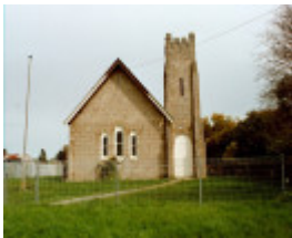
Snake Valley Wesleyan Front