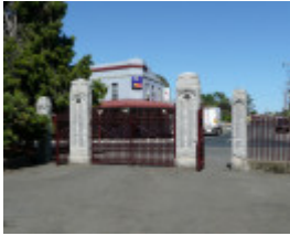
Prince's Park Memorial Gates