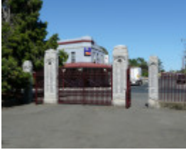
Prince's Park Memorial Gates