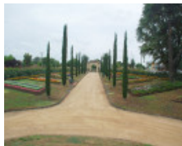
WHITE HILLS BOTANIC GARDENS SOHE 2008