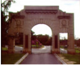
Arch of Triumph, White Hills Botanic Gardens