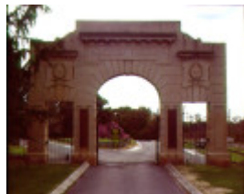
Arch of Triumph, White Hills Botanic Gardens