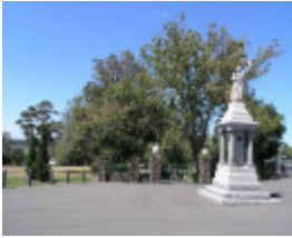
FOOTSCRAY PARK SOHE 2008