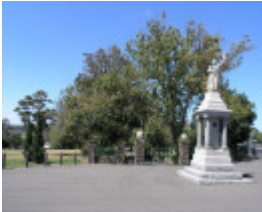
FOOTSCRAY PARK SOHE 2008