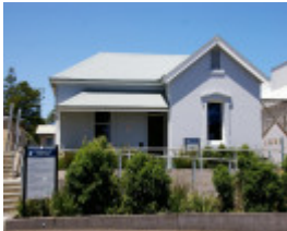
H543 orderly room residence