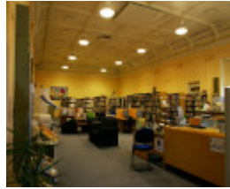
H543 orderly room interior