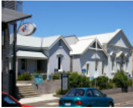
H543 orderly room residence kepler st1