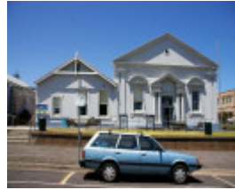
H543 orderly room gun room