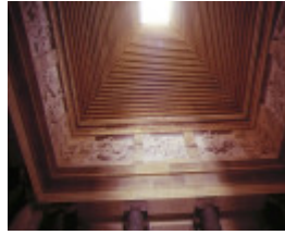
shrine of remembrance st kilda road melbourne ceiling of inner shrine