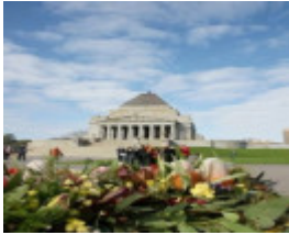
Shrine of Remembrance.jpg