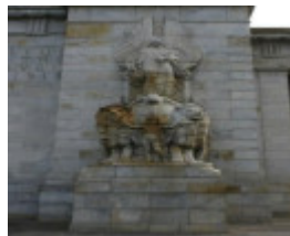
Shrine of Remembrance Butress Front View.jpg