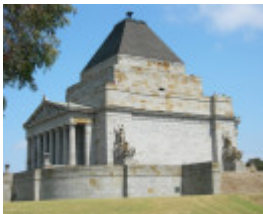
SHRINE OF REMEMBRANCE SOHE 2008