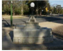
Shrine of Remembrance Horse Trough.jpg