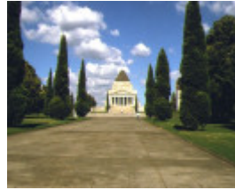
1 shrine of remembrance st kilda road melbourne front view