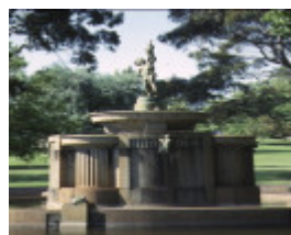
shrine of remembrance st kilda road melbourne macrobertson fountain nov1990