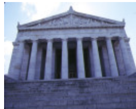
shrine of remembrance st kilda road melbourne front view of columns