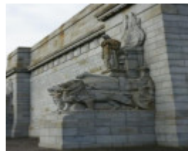
Shrine of Remembrance Lion Butress.jpg