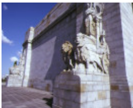
shrine of remembrance st kilda road melbourne side view with lions