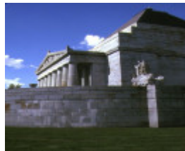
shrine of remembrance st kilda road melbourne side elevation