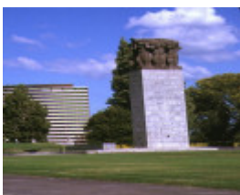
shrine of remembrance st kilda road melbourne ww2 memorial