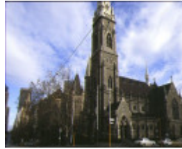
1 scots church melb exterior