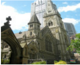
SCOTS CHURCH SOHE 2008