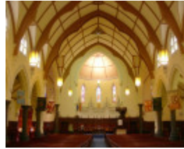
SCOTS CHURCH SOHE 2008