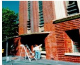
former royal australian army medical corps training depot a'beckett street melb facade detail