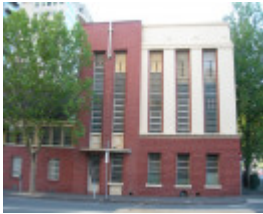
FORMER ROYAL AUSTRALIAN ARMY MEDICAL CORPS TRAINING DEPOT SOHE 2008