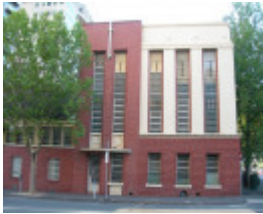
FORMER ROYAL AUSTRALIAN ARMY MEDICAL CORPS TRAINING DEPOT SOHE 2008