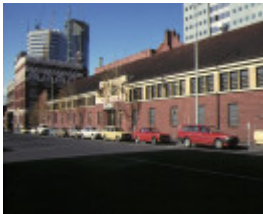
former royal australian army medical corps training depot a'beckett street melb front view 1990