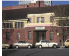
1 former royal australian army medical corps training depot a'beckett street melb front entrance 1990