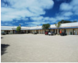
FORMER FORT FRANKLIN (PORTSEA CAMP) SOHE 2008