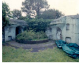
h01090 1 fort franklin portsea gun emplacement 02 0903 mz