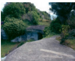
h01090 fort franklin portsea gun emplacement 01 0903 mz