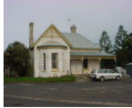
h01090 fort franklin portsea commandants house 01 0604 js