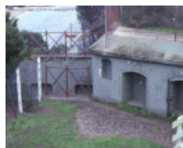
h01090 fort franklin portsea gun emplacement jun1983 mz