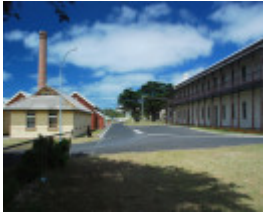
POINT NEPEAN DEFENCE AND QUARANTINE PRECINCT SOHE 2008