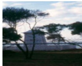
H02030 point nepean heatons monument