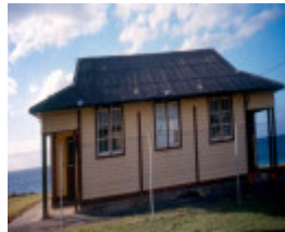
H02030 point nepean showerblock