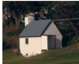
H02030 point nepean shepherds hut