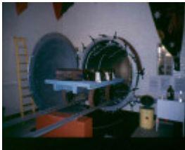
H02030 point nepean quarantine interior