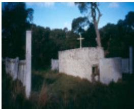
H02030 point nepean crematorium