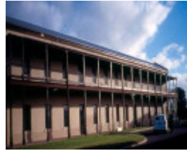
H02030 1point nepean hospital