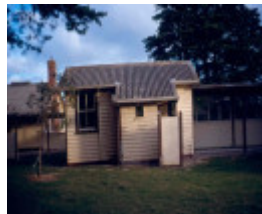
H02030 point nepean isolation hospital