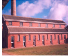
H02030 point nepean bathhouse2