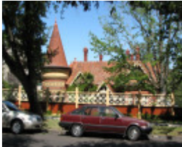
DARNLEE SOHE 2008