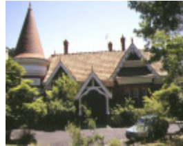
1 darnlee lansell road toorak front view