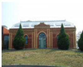
BENDIGO ART GALLERY SOHE 2008