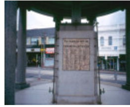
Kew War Memorial Honour Board 2004