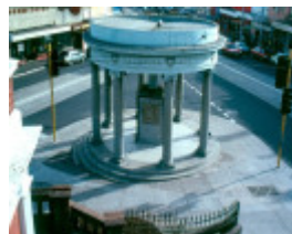
Kew War Memorial 2004