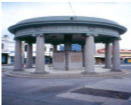
Kew War Memorial 2004