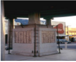
Kew War Memorial Honour Board 2004