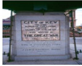
Kew War Memorial Honour Board 2004