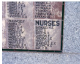
Kew War Memorial Honour Board 2004