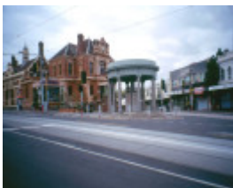
Kew War Memorial 2004