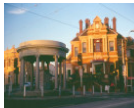
Kew War Memorial 2004