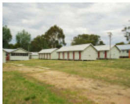
BLOCK 19 SOHE 2008