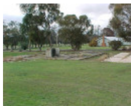
h01835 block 19 bonegilla amenities building pads pm1 jun03