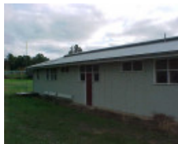
h01835 block 19 bonegilla amenities 1 pm1 jun03