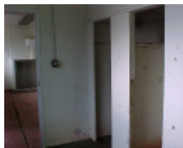
h01835 block 19 bonegilla amenities 4 pm1 jun03