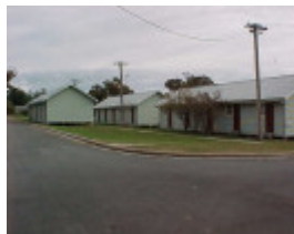
1 bonegilla migrant camp accommodation huts