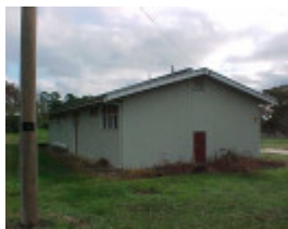
h01835 block 19 bonegilla amenities 2 pm1 jun03