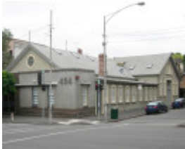
EAST COLLINGWOOD RIFLES VOLUNTEER ORDERLY ROOM SOHE 2008