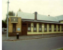
1 east collingwood rifles volunteer ordely room east melbourne