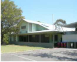
ANZAC HALL SOHE 2008