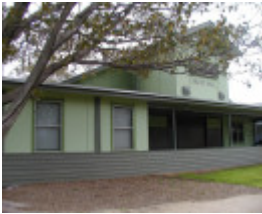
anzac hall brens drive royal park close view she project 2004