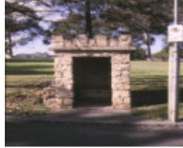
ANZAC Hall Brens Drive Royal Park Parkville Drive