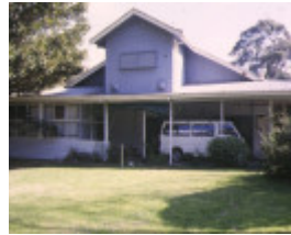
anzac hall brens drive royal park parkville front view aug1998