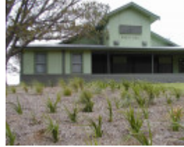
h01747 1 anzac hall brens drive royal park distant view she project 2004