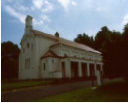
1 mont park ernest jones hall