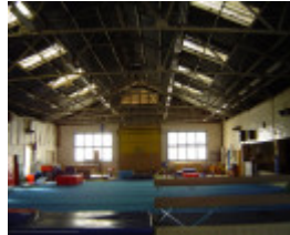
6168 Warragul Drill hall may07 ac 16