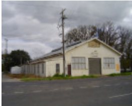
6168 Warragul Drill hall may07 ac 4