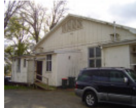
6168 Warragul Drill hall may07 ac 10