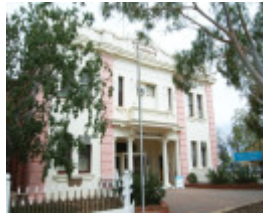
SOLDIERS' AND CITIZENS' MEMORIAL HALL AND FORMER MUNICIPAL CHAMBERS SOHE 2008