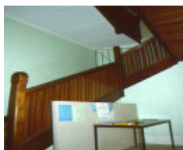
Jeparit Town Hall Staircase August 2000