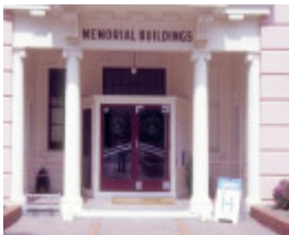
h01905 soldiers and citizens memorial hall jeparit front entrance she project 2004