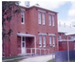
h01905 soldiers and citizens memorial hall jeparit rhs building she project 2004