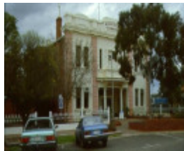
1 jeparit hall chambers ac2 august00