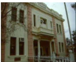
Jeparit Hall Front August 2000