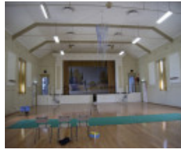
SOLDIERS' AND CITIZENS' MEMORIAL HALL AND FORMER MUNICIPAL CHAMBERS SOHE 2008