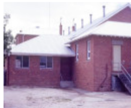
h01905 soldiers and citizens memorial hall jeparit back view she project 2004