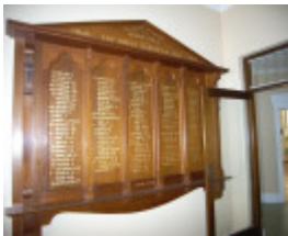
SOLDIERS' AND CITIZENS' MEMORIAL HALL AND FORMER MUNICIPAL CHAMBERS SOHE 2008