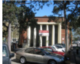
11488 Royal Melbourne Regiment Drill Hall Front Portico 11 Sept 2006 mz