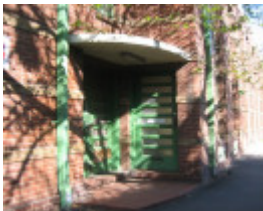
11488 Royal Melbourne Regiment Drill Hall Corner Detail 11 Sept 2006 mz