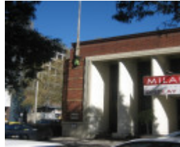
11488 Royal Melbourne Regiment Drill Hall Front Detail 11 Sept 2006 mz