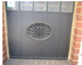
11488 Royal Melbourne Regiment Drill Hall Vent Detail 11 Sept 2006 mz