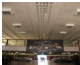
11488 Royal Melbourne Regiment Drill Hall Drill Hal Ceiling 11 Sept 2006 mz