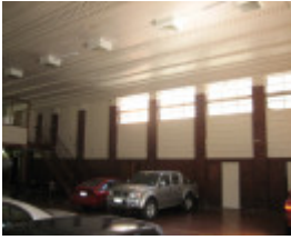
11488 Royal Melbourne Regiment Drill Hall Hall Interior 11 Sept 2006 mz