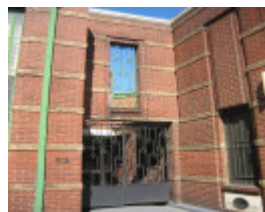
11488 Royal Melbourne Regiment Drill Hall Exterior Detail 02 11 Sept 2006 mz