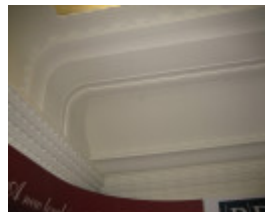
11488 Royal Melbourne Regiment Drill Hall Officers' Mess Cornice and Ceiling Detail 11 Sept 2006 mz