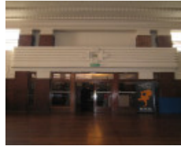
11488 Royal Melbourne Regiment Drill Hall Band Gallery 11 Sept 2006 mz