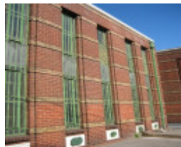
11488 Royal Melbourne Regiment Drill Hall Exterior Window Detail 11 Sept 2006 mz