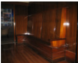
11488 Royal Melbourne Regiment Drill Hall Officers' Mess Bench 11 Sept 2006 mz