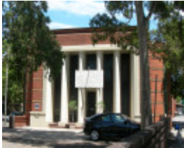
ROYAL MELBOURNE REGIMENT DRILL HALL SOHE 2008