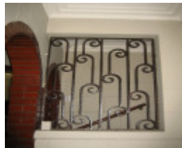
11488 Royal Melbourne Regiment Drill Hall Wrought Iron Screen Detail 11 Sept 2006 mz