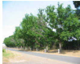
12270 Eurack avenue of honour11 nov05