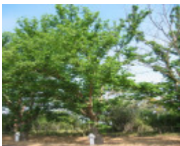
Eurack Avenue of Honour November 2005