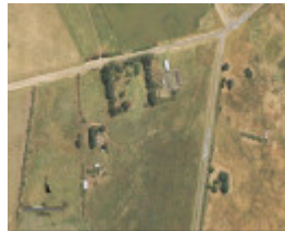
Eurack Aerial Photo