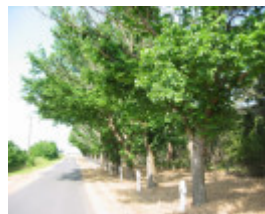
Eurack Avenue of Honour November 2005