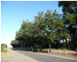
AVENUE OF HONOUR SOHE 2008