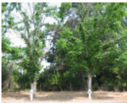
Eurack Avenue of Honour November 2005