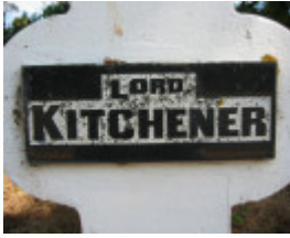
Eurack Avenue of Honour November 2005