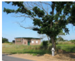
Eurack Avenue of Honour November 2005