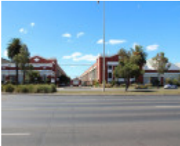
Ford Motor CompanyGeelong1