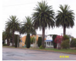
23174 War Memorial Glenelg Hwy Glenthompson 1043