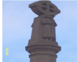
23174 War Memorial Glenelg Hwy Glenthompson statuette 1046