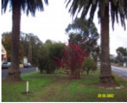
23174 War Memorial Glenelg Hwy Glenthompson 1048