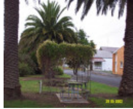
23174 War Memorial Glenelg Hwy Glenthompson 1047