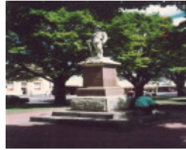
26784 Empire War Memorial 02