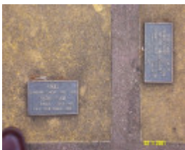
23634 Cavendish Memorial Park 0131