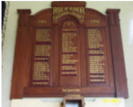
23634 Cavendish Memorial Hall 0138