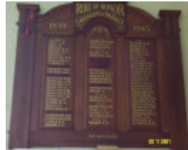
23634 Cavendish Memorial Hall 0139