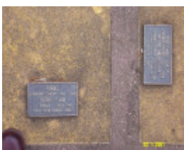
23634 Cavendish Memorial Park 0131