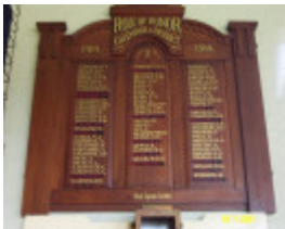
23634 Cavendish Memorial Hall 0138