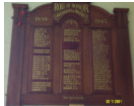
23634 Cavendish Memorial Hall 0139