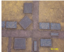
23634 Cavendish Memorial Park 0127