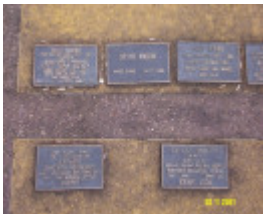
23634 Cavendish Memorial Park 0128