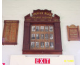
23634 Cavendish Memorial Hall 0137