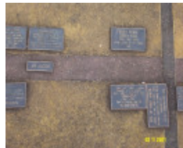
23634 Cavendish Memorial Park 0129