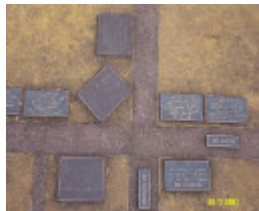
23634 Cavendish Memorial Park 0127