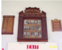
23634 Cavendish Memorial Hall 0137