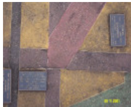
23634 Cavendish Memorial Park 0130