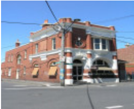
STATE SAVINGS BANK SOHE 2008