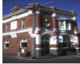
1 state savings bank ballarat street yarraville side view