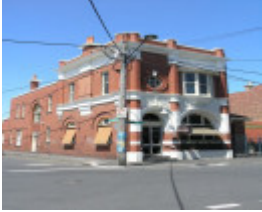
STATE SAVINGS BANK SOHE 2008