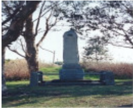
Cora L 1.jpg