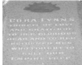
Cora L 2.jpg