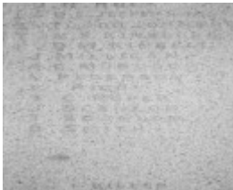
Cora L 4.jpg