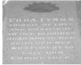
Cora L 2.jpg