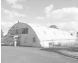
Former Army Radio Station Diggers Rest