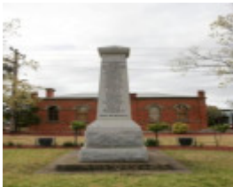
Melton War Memorial.jpg