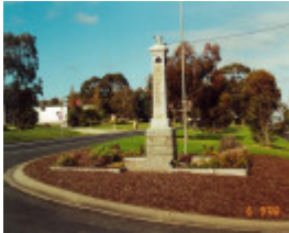
Toora World War 1 Soldiers' Memorial