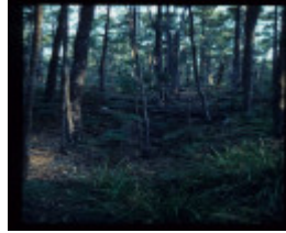
THOMPSON BROTHERS' SAWMILL