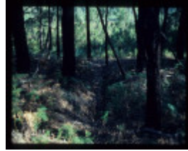
JAMIESON & THOMPSON SAWMILL