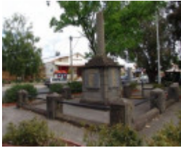
Meeniyan and Stony Creek WWI Memorial.jpg