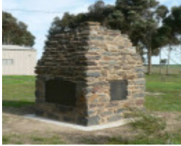
WW1 and WW2 Memorial Wallinduc